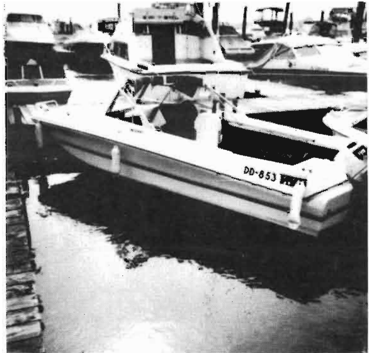
Ed Semcheski's boat PA.